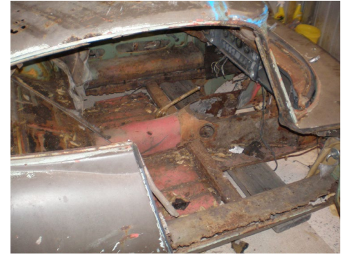
Next step - to bring it back to life.

I don't know much of the history of the car except it arrived in Australia in 1991 and the person I had purchased if from had picked it a up from a deceased estate.