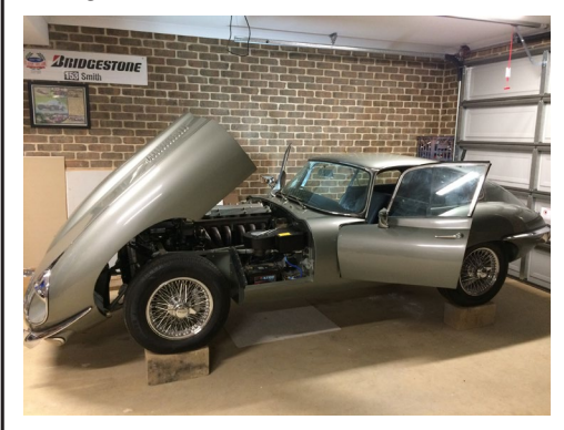
Once the car was sprayed, I then ran new wiring looms with a bit of help from the old man, we managed to get everything working.