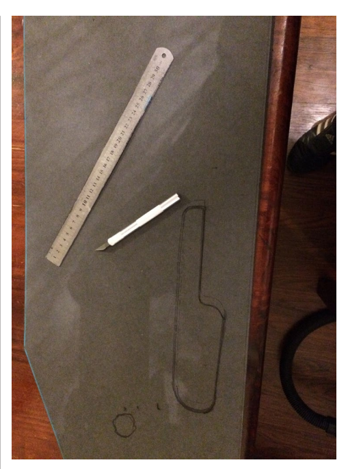
I even learned how to sew and hand stitched the rear wheel arch covers (I'd never do that again though it was extremely mind numbing)