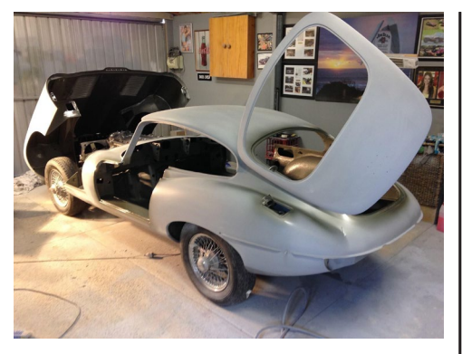
Running low on funds I decided to have a crack at spraying the car myself, with a bit of practice painting the internals, I thought how hard can it be.