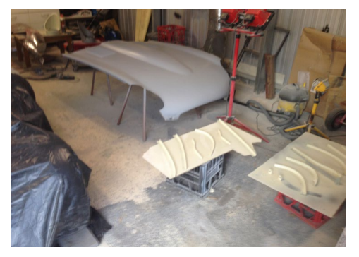
I also had to make new rolled edges for both of the front fenders as they were rusted away. Once the bonnet was fitted, I then pulled the car apart and sprayed the inside and undersides of doors, bonnet and rear hatch.

It took about six months to get it right and make it fit properly. I used strips of lead and made patterns from the good side of the bonnet. I then used these to get the shape correct on the damaged side. With a lot of cutting, hammering and shrinking it came up better than expected.