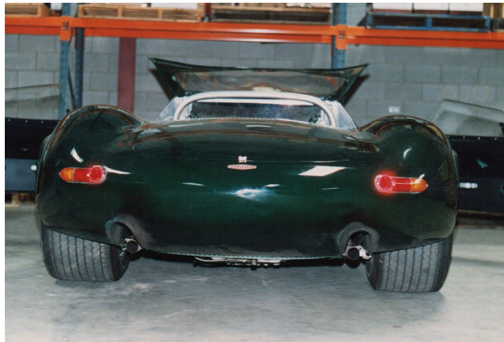
The inside of the XJ13 was pure racing car with bare aluminium, no insulation and aluminium radiator pipes running above the passenger floor.